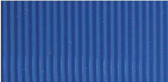
Belt surface before exposure to UV-C radiation